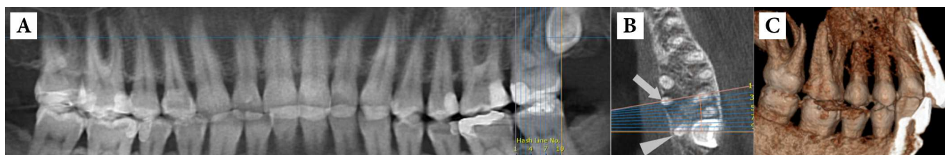
Figure 5. A) Panoramic view of a patient complaining of pain in the upper left quadrant: the second molar has a normal appearance. B) The axial view showing the abnormal anatomy of the second molar with four roots. C) Three dimensional reconstruction of the alveoli showing the two separate palatal roots of maxillary left second molar.

palatal roots of maxillary first molars. The presence or absence of the maxillary sinus between the roots could be presented, and the distance between the cortical plate and the palatal root apex could be measured (Figure 2).