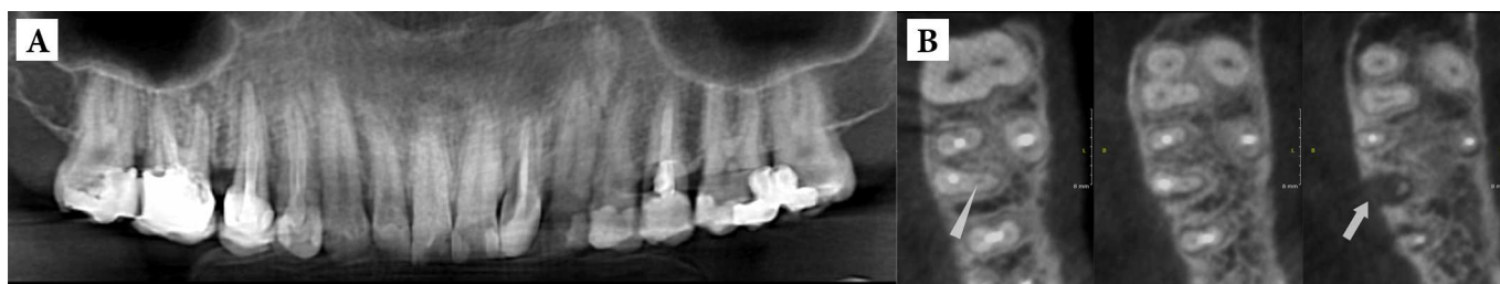
Figure 1. A) A panoramic image of a patient complaining of dull pain two years after root canal therapy (RCT) of the right maxillary first molar. Note the apical periodontitis around the apex of the MB root; B) Axial CBCT scanning of the maxillary right quadrant showing the undetected and untreated second mesiobuccal canal (MB2) (arrow head)

adjacent anatomical structures [9]. They are used for preoperative, intraoperative and postoperative assessment and follow-up. Despite many applications in endodontics, there are still many shortcomings that can be named for periapical X-ray imaging. As a result of superimposition, periapical radiographs reveal limited aspects of the 3D anatomy thus the amount of information gained from conventional film and digitally captured periapical radiographs is limited [5]. Several factors can result in the reduced diagnostic ability of conventional radiography [9] which are discussed below.