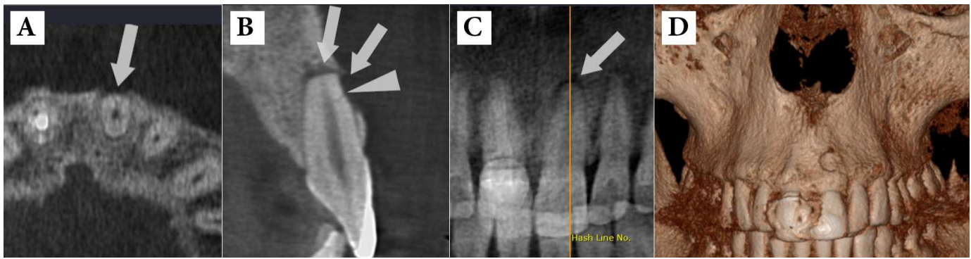
Figure 3. A) CBCT view shows a tiny horizontal root fracture on the buccal surface of the maxillary left central incisor caused by impact trauma; B and C) Note the two separate periradicular lesions in the apical area (arrow) and adjacent to the fracture line (arrow head) due to tooth necrosis; D) Three-dimensional reconstruction of the lesion in the periradicular buccal area

In general, the smaller scan volume causes the higher spatial resolution of the image. It is favorable that the optimal resolution of any CBCT imaging system used in endodontics does not exceed the average width of the periodontal ligament space (200 \mu\text{m} ), considering the the earliest sign of periapical pathology being the discontinuity in the lamina dura and widening of the periodontal ligament space [7].