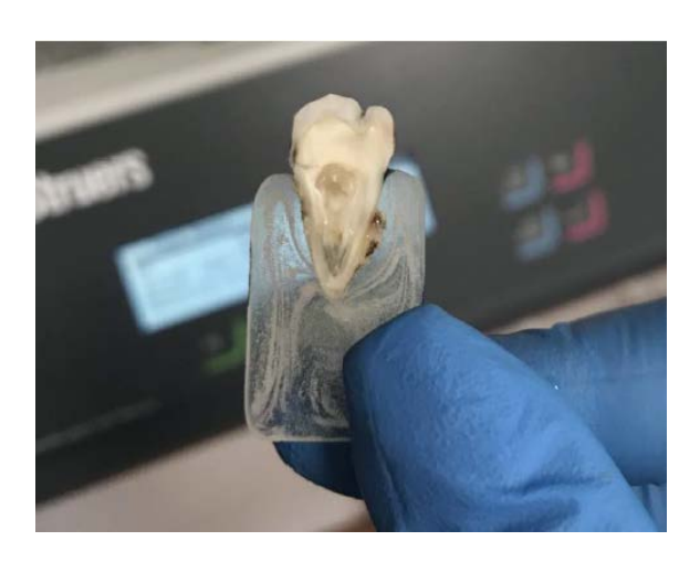
Figure 3: An example of the sectioned tooth