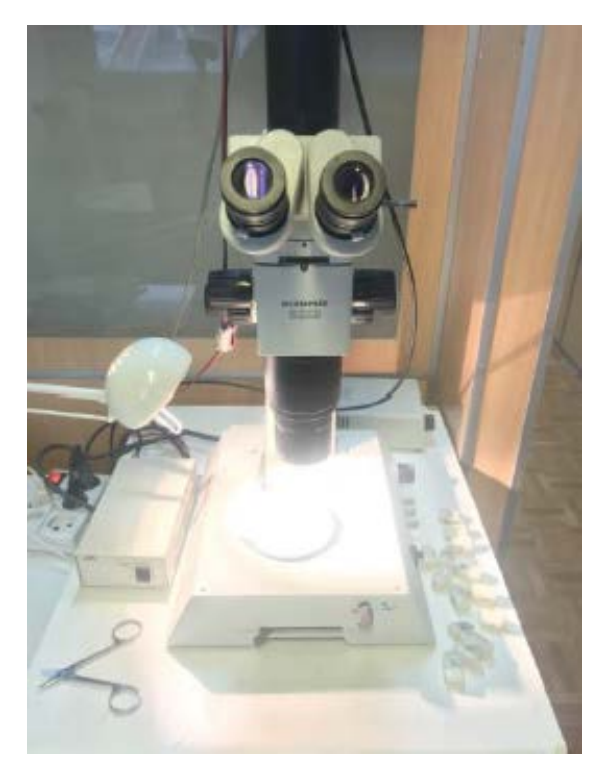
Figure 4: Stereomicroscope