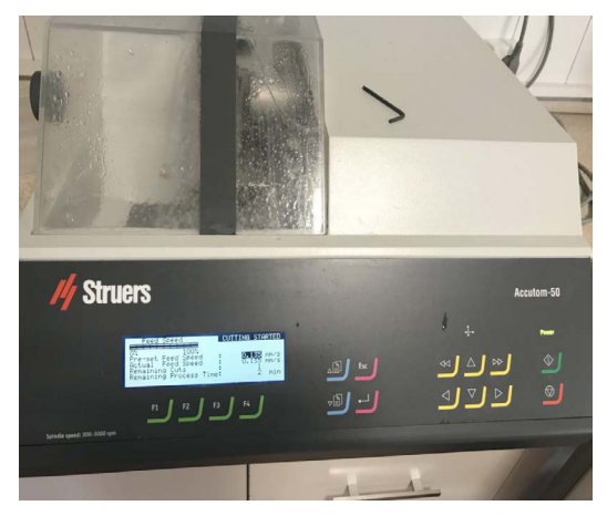
Figure 2: The device for sectioning teeth